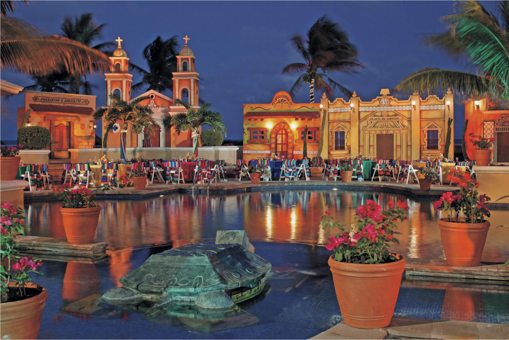
MAYAN TERRACE AND POOL DECK